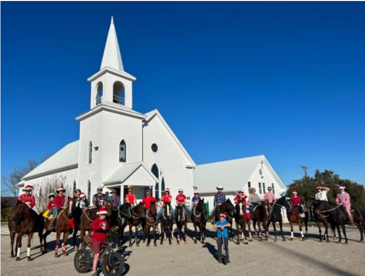
Left, the St. Peter's horseback carolers. Always a treat during the Christmas season.