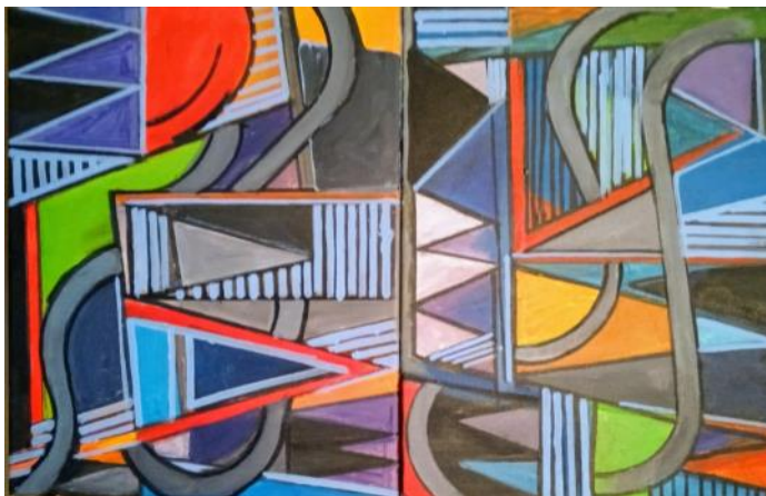
Above, Karl Senn, "Rolling Uphill 2020," 12x32" Two panel dyptych acrylic on canvas.