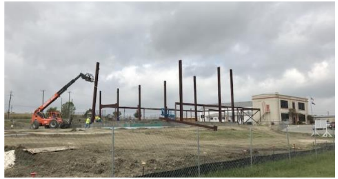
Steel for the new building at Coupland School is going up. See article on page 15 about the school construction.