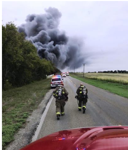
Coupland firefighters heading to a fire in Walburg.

The Chili Supper is such an important part of our calendar, as a community event and as a fundraiser, that we’re absolutely determined not to allow the tradition to slip, even though it may have to look a little different. We’re looking forward to seeing everyone again this coming year, even if it will have to be in passing.