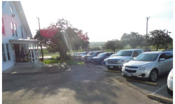
The St. Peter's congregation in vehicles gathered outside the church to hear services broadcast over the radio before indoor services were resumed.