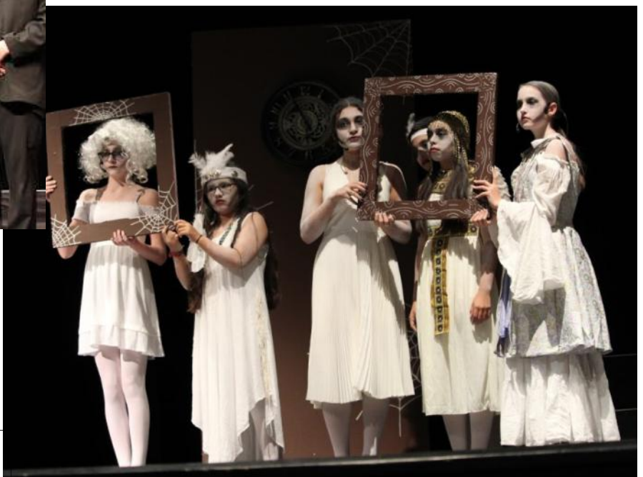
Addams Family Photos by Crystal Ward