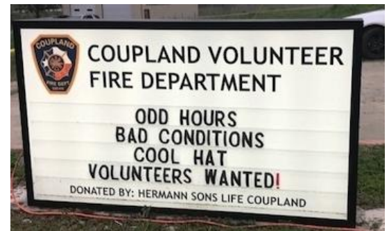
Right, Thanks to Hermann Sons Life Coupland for the beautiful new sign in front of the Fire Station.