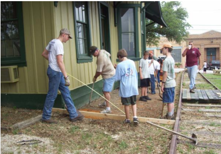
Back in 2010, members of Scout Troop 167 installed the Depot sidewalk with the new personalized pavers. Right, preparation for the new sidewalk to the caboose with additional personalized pavers..

The paver project has continued as a long-term fundraiser for the Depot and caboose. You can order personalized pavers for a donation of $35 each. Call Judy Downing, 512-293-0501.