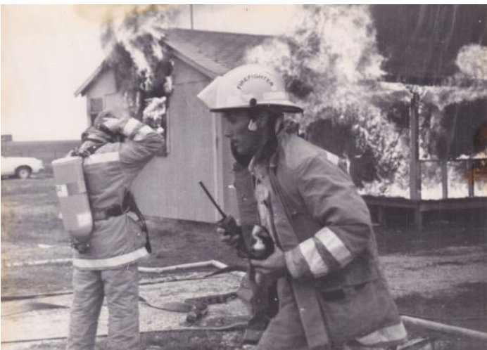
Above, historic photo of CVFD fighting a house fire.