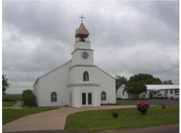
Yegua Creek Evangelical Free Church

The second annual Remembrance Day at the Type Cemetery will take place on the third Sunday in May. The date is May 19 at 3 p.m. The program will be held at the Yegua Creek EFC at 1200 CR 466.