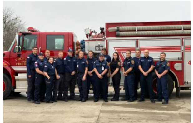
Coupland Volunteer Firefighters at the Chili Supper.