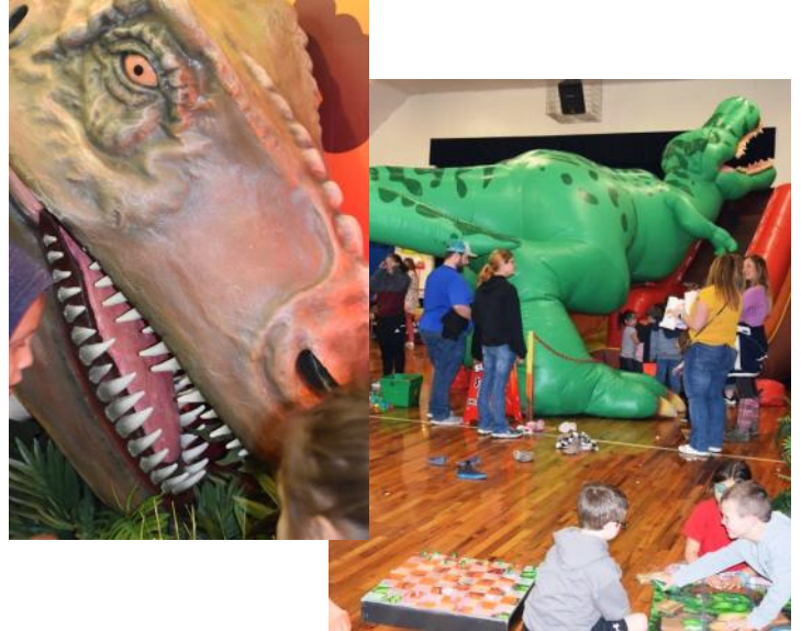
Dinosaurs Live

Dinosaurs Live. On Monday, February 25, Dinosaurs Live created a ROARING FUN TIME at Coupland School. It was a free event with real life-like dinosaurs, activities, and family fun. Other things offered were a dino-slide, face-painting, concessions, and souvenirs. Many families from our community enjoyed this event!