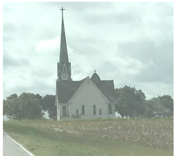
The iconic New Sweden Church, emblematic of the area that residents are trying to preserve.

Texas Commission on Environmental Quality Office of the Chief Clerk MC-105 PO Box 13087 Austin, TX 78711-3087