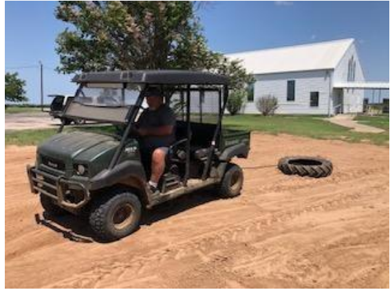
Dirt work at Type Church

Type Church is in the neighborhood. The address is 1200 County Road 466 and Pastor Ryan Evans' phone number is (281) 229-8962. He can also be reached at pastorryan91@gmail.com .